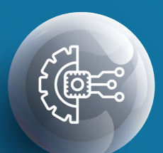
Control and Automation